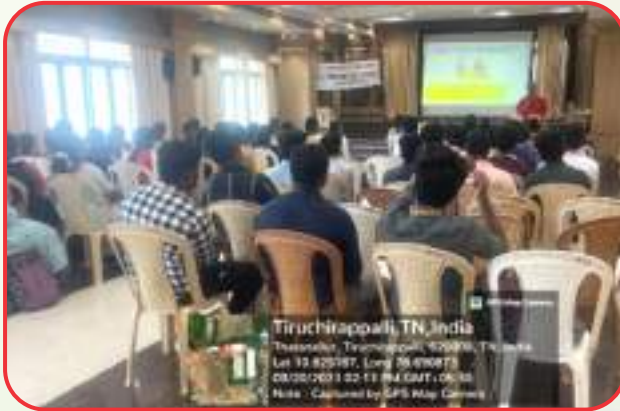
Awareness at Holy Cross College, Trichy