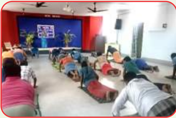
Observation of YOGA DAY