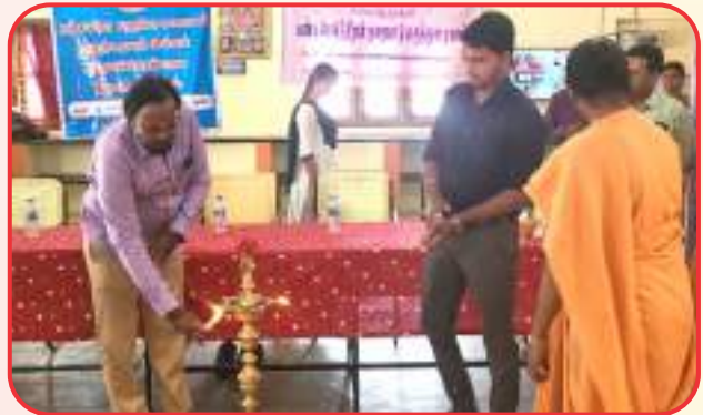
Special Medical Camp at Sathya Ammaiya Govt Home, Mathur on 03.03.2024