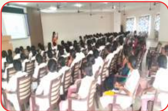
Awareness Programme at SRM College of Physiotherapy, Trichy