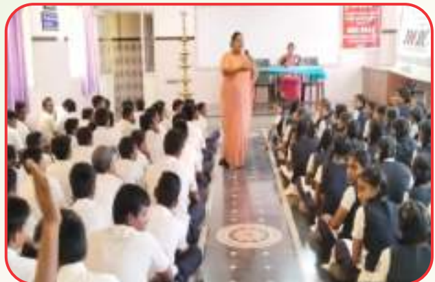
Awareness at St. Francis Matriculation School, Trichy