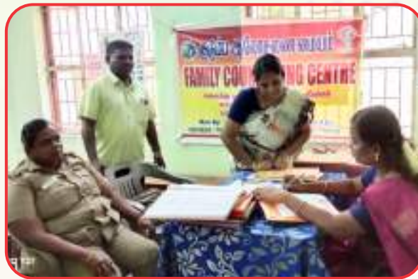
DSWO Visited on 03-01-2024