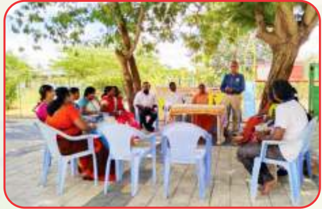
Discussion with Staffs of CARE AND SHARE NGO