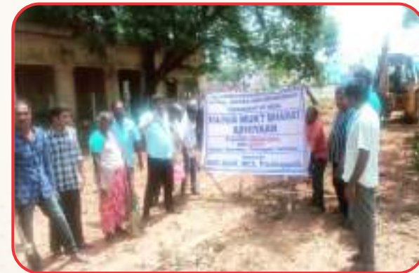
Cleaning work at Fort Railway Station, Trichy