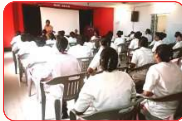
Awareness to Nursing Students