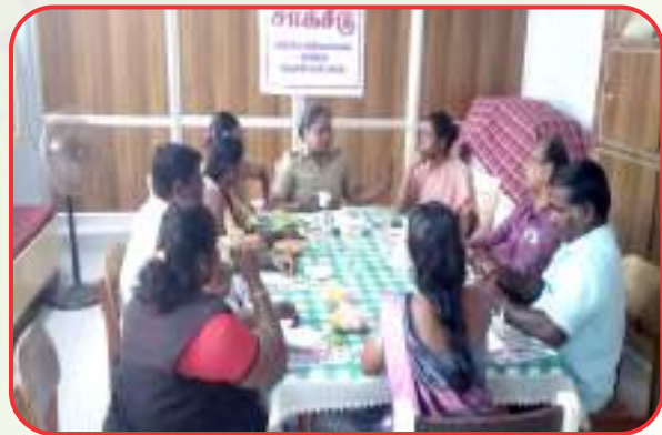
Awareness to Women group, Devimangalam