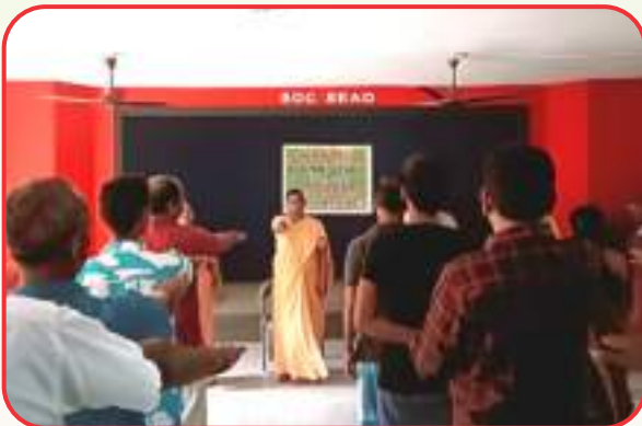
World AIDS Day celebration at SOCSEAD Hall