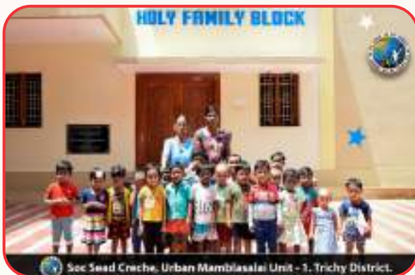
Soc Sead Crèche, Urban Mambalasalai Unit - 1, Trichy District.