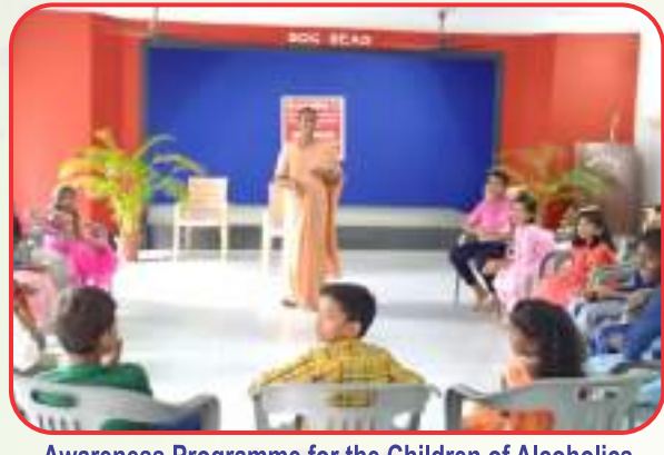
Awareness Programme for the Children of Alcoholics