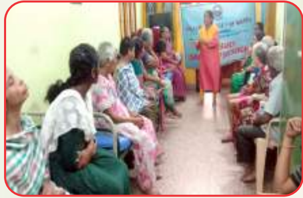
Awareness to Senior Citizens