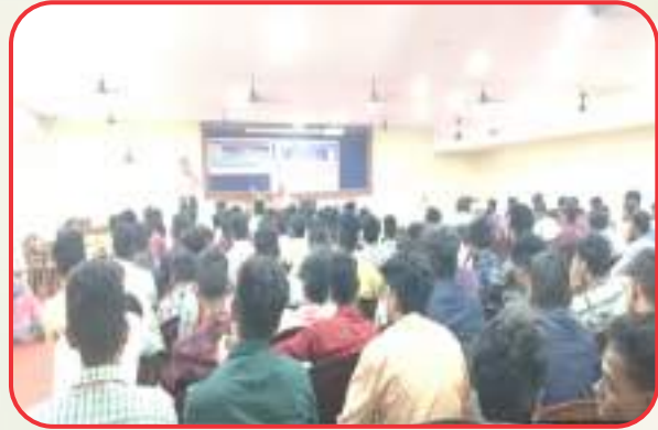
Awareness Programme at Srimad Andavan Arts and Science College, Trichy