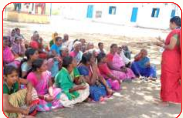
Awareness to Women's Group, Devimangalam