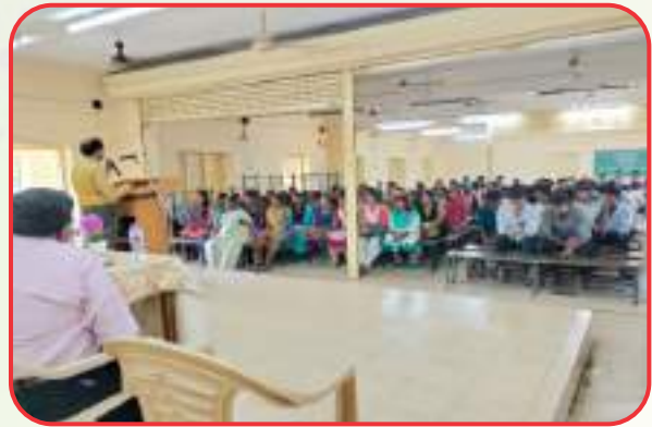
Awareness at Govt. Arts and Science College