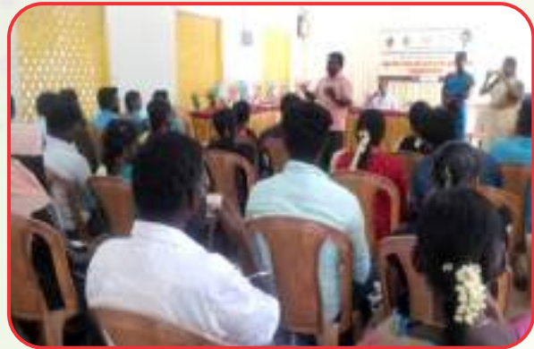
Post Marital Counselling to New Couple