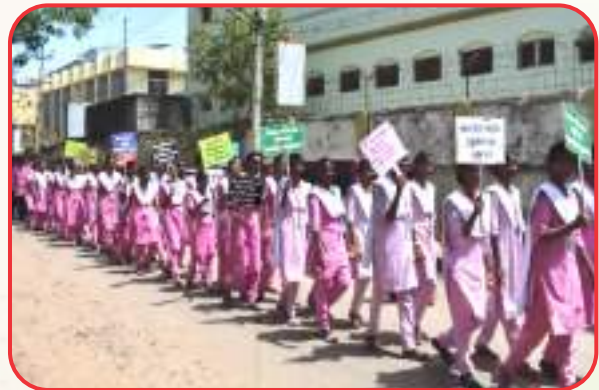
Rally on "International Day Against Drug Abuse" at Singarathoppu , Old Goodshed Road and Super Bazar Street