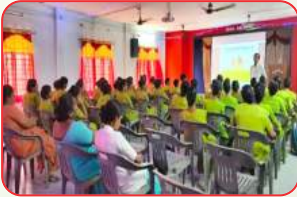
Awareness on the III-Effects of Alcoholism at SOC-SEAD HALL, for the Nursing Students of Cauvery College