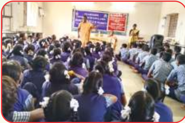
Awareness at Govt Hr Sec School, Thirupanjili