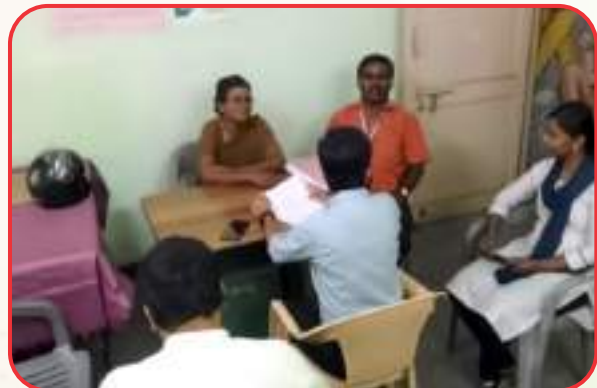
Visit by National Commission for Women, Centre for Law Team to our FCC in Srirangam AWPS