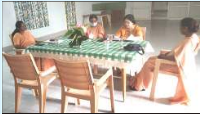
Governing Body Meet