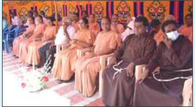
Blessing of the Holy Family Block at Adoption Center - Mambalasalai