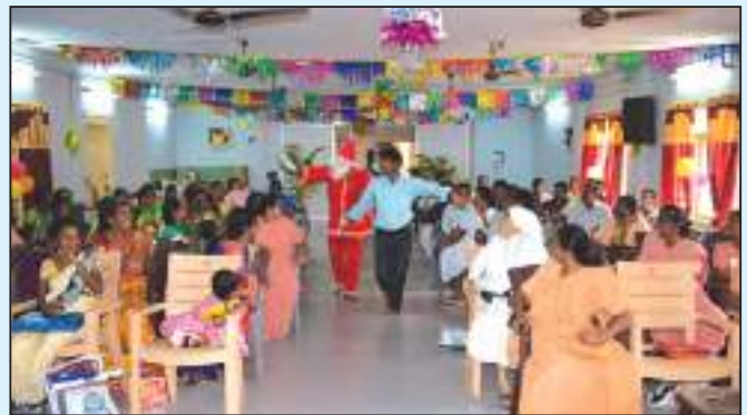
Merry Christmas and Happy New year to all