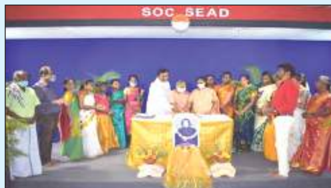
Celebration of Mother Foundress Day