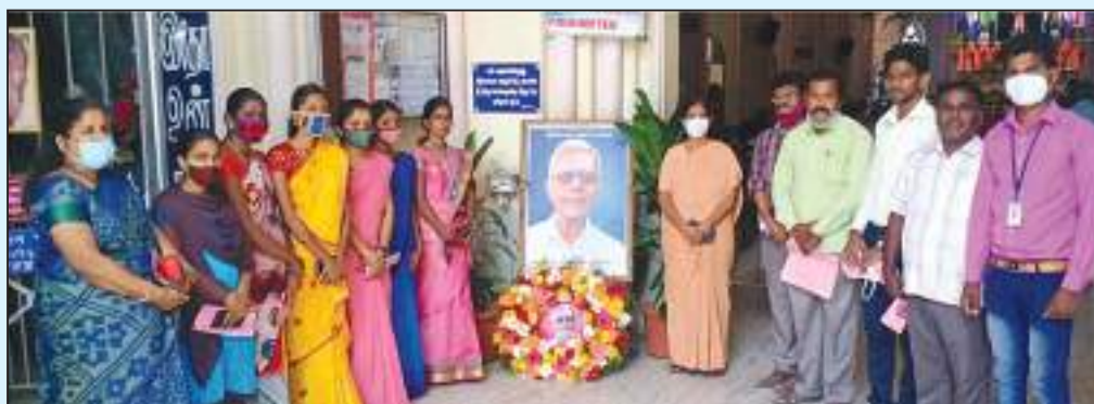
Homage to Rev. Fr. Stan Swamy