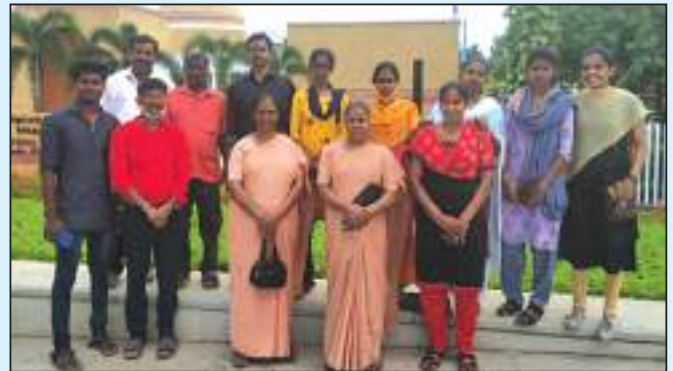
Tour to Thanuskodi and A.P.J.Abdul Kalam National Memorial