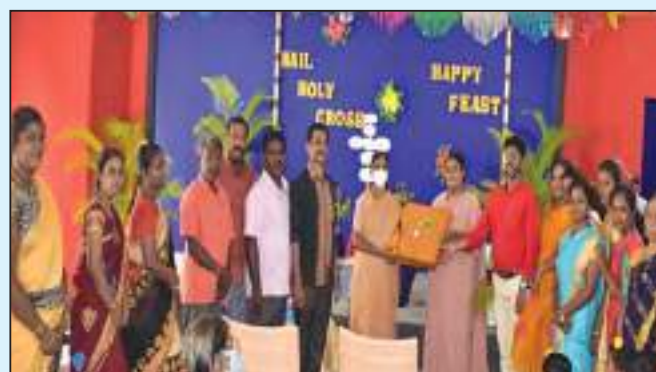
Celebration of Holy Cross Feast Day