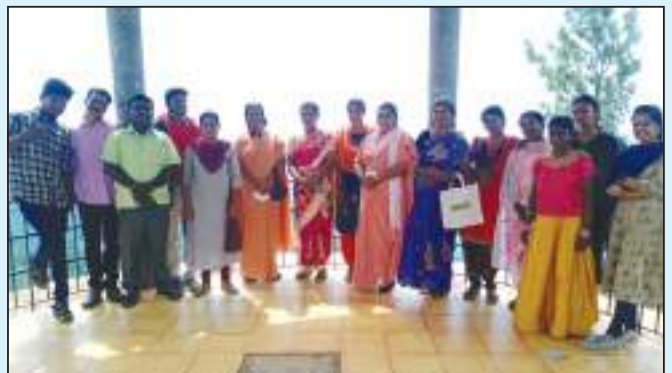
Staff Picnic to Yercaud