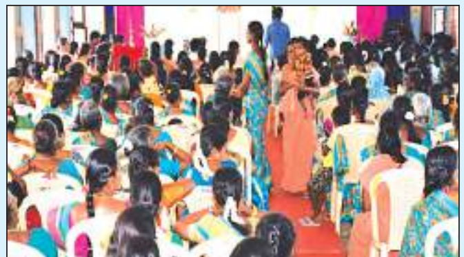
Participation in the Silver Jubilee Celebration of POORNA - Palani