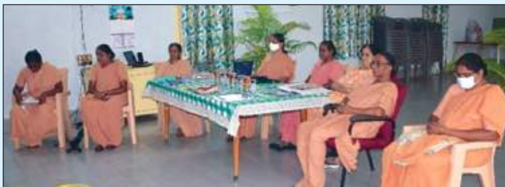
Annual General Body Meet