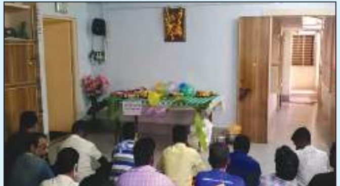
Celebration of Ayutha Pooja