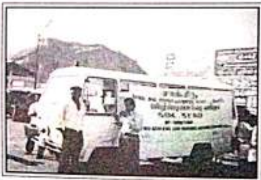
Awareness on Wheels at Namakkal