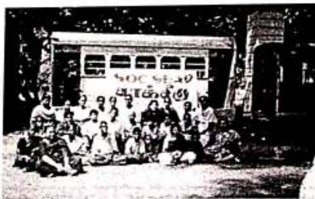
Disabled children's exposure visit to Makkambu organised by Rehabilitation Trainees

A total number of 17 Social work students that is 5 in Family Counselling Centre, 7 in deaddiction treatment Centre and 5 in Child line were trained during this year. And two students from Rehabilitation Science were placed in Child labour eradication department. Thus the students were given effective on-the-job training in SOC SEAD which will be useful in their future endeavours.