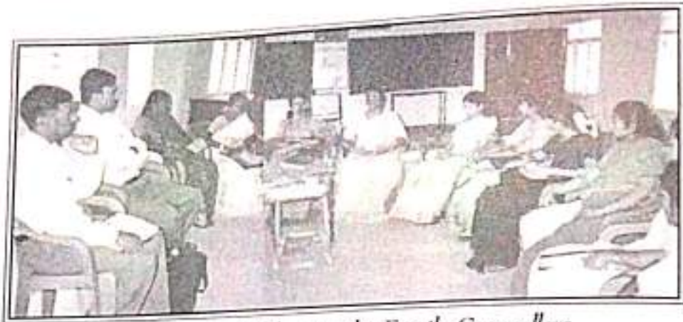
Our Director Addresses the Family Counsellors in Peer Review Meeting of III Zone