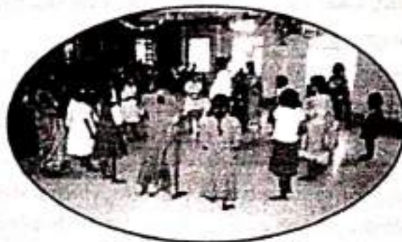
Sponsorship Children in Christmas celebration

As an expression of gratitude, the sponsored children are extremely happy to thank their sponsors every year through personal letters and greeting cards. During festival times all the children get together and share their joy, happiness and feelings.