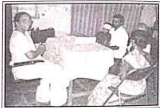
Our Child Line Director repatriates a Child with her family