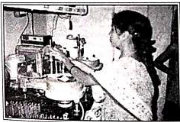
A Women beneficiary (Gem Cutting Machine) of Thiruvarangapally