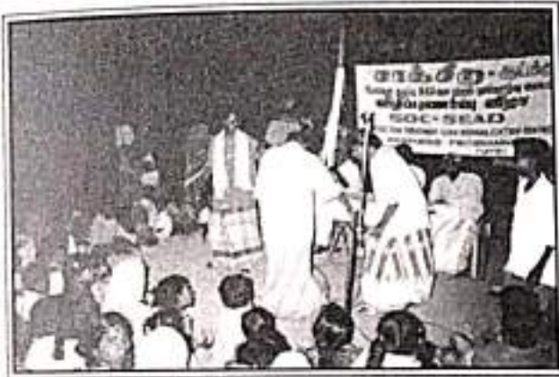
Street Theatre on De-addiction at Pudhur Uthamanoor