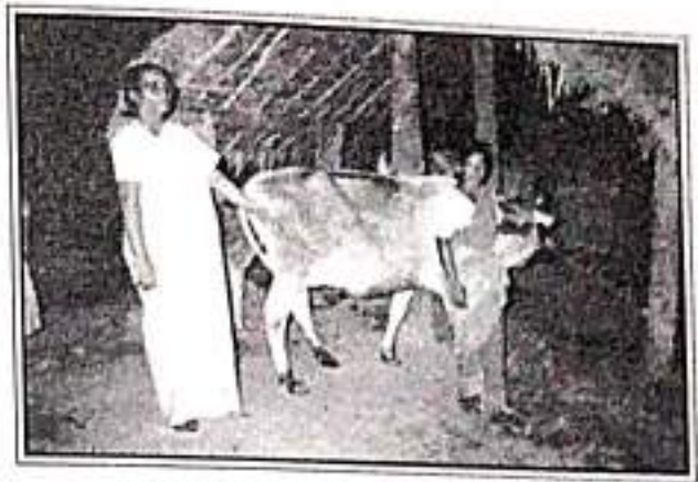
Distribution of milk animal to the women of Thiruvarangapally village