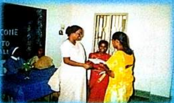
Our Director distributes Tailoring Course Certificate