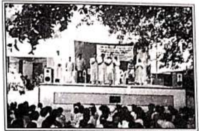
School Health Education at Thiruvallanthurai