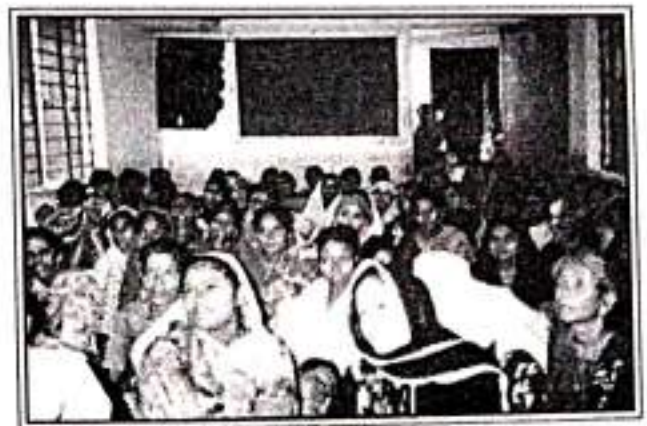
Participation of women in Day against Violence on women