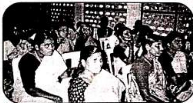
Leadership Training to SHG members at Ayikudi

It was a hard task initially to mobilize the women with all their inhibitions. With all the training and awareness creation, the women have grown out of their inhibitions to assert their rights. They are empowered to begin self-employment programmes through the schemes of the Government.