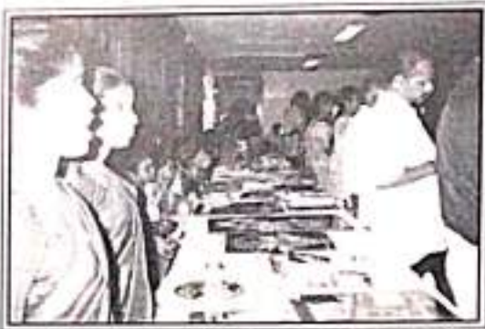
Participation of Women sanga member & the animators in Exhibition