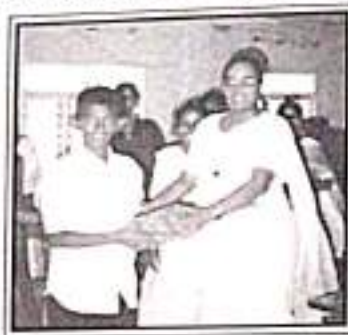
Distribution of gifts to a disabled Child by our Director