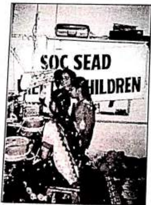
Assistance of Gem cutting machine to Women at Thiruvarangapatty by our Director