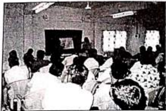
A session to police officials by SOC SEAD's resource person in gender sensitisation training program of TN Police