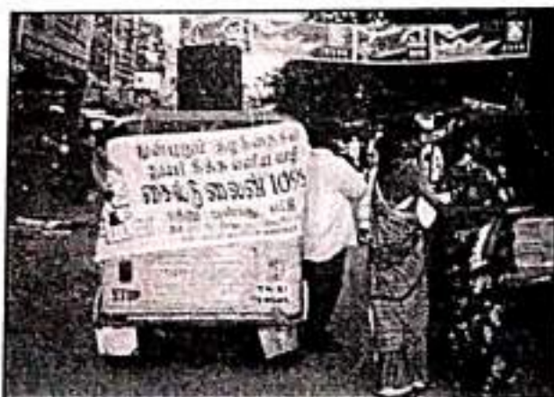
Auto awareness campaign of Childline