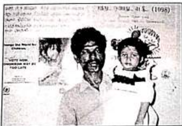
Childline repatriates a lost child from Anbil with the parent