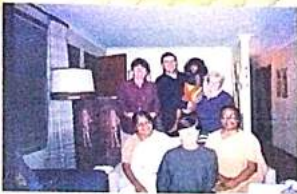
Our Director & Vice President with the Adoptive parents in Australia