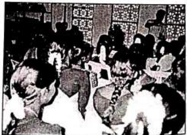
Training to SHG women by Department of BDO, Ayikudi