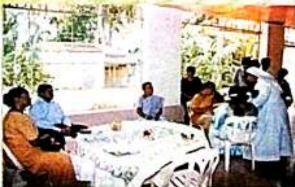
Inspection of the Creche by the team from Directorate of Social Welfare, Chennai.