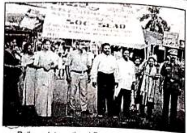
Rally on International Day against Drug abuse, Samayapuram.