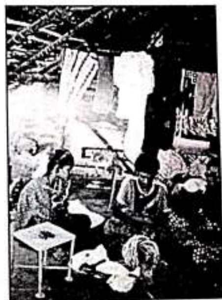
Volunteers giving home training to disabled