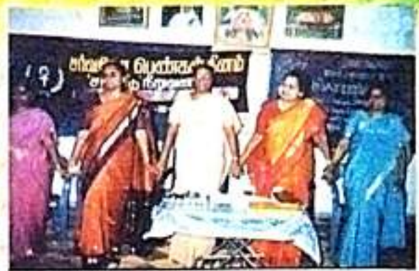
Oath taking during celebration of International Women's Day