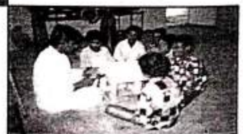
Noon-meal provision to street children