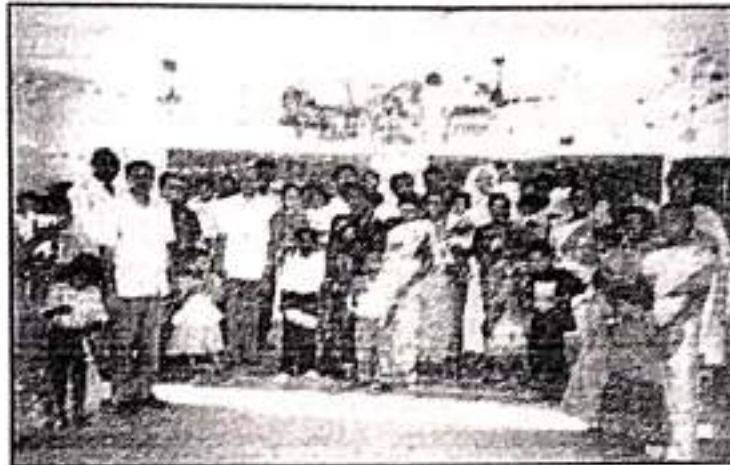
Adoption Parents get together for Christmas at SOC SEAD

Every child has a right to have a home and family irrespective of the nature of their birth and status, based on this motivation factor SOC SEAD children's home at Mambalasalai is functioning by helping childless couples to adopt the children.