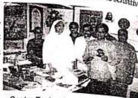
Centre Review team visited our Office

Education is a process of growth, of the eternalisation and actualisation of human potential. Education can change the lives of an individual by developing their competence, capabilities and creativity. Individuals should be educated to develop confidence to take up new enterprises; to develop sensitivity to problems which affect the community, to become sensitive to the complexities of gender issues; to help eradicate illiteracy,