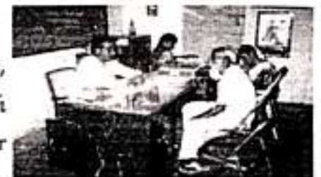
Counselling Services at Counselling Centre for Drug Addicts, Trichy.